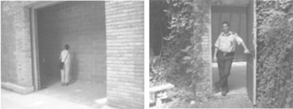
Sierra. Wall Enclosing a Space. Spanish Pavilion, Venice Biennale, 2003.

being fluid and unconstrained by exposing how all our interactions are, like public space, riven with social and legal exclusions. 58