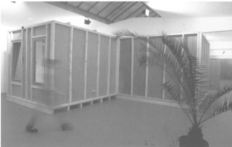
Tiravanija. Untitled 1996 (Tomorrow Is Another Day). Kölnischer Kunstverein, Cologne, Germany, 1996.

tion/performance was undertaken in Untitled (Tomorrow Is Another Day) (1996) at the Kölnischer Kunstverein. Here, Tiravanija built a wooden reconstruction of his New York apartment, which was made open to the public twenty-four hours a day. People could use the kitchen to make food, wash themselves in his bathroom, sleep in the bedroom, or hang out and chat in the living room. The catalog accompanying the Kunstverein project quotes a selection of newspaper articles and reviews, all of which reiterate the curator's assertion that "this unique combination of art and life offered an impressive experience of togetherness to everybody." 16 Although the materials of Tiravanija's work have become more diverse,