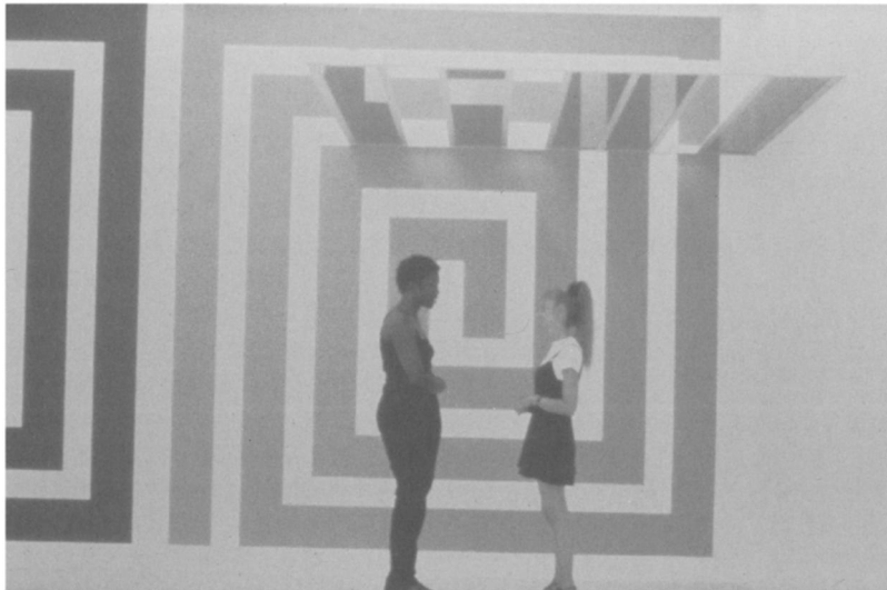
Gillick. Big Conference Centre Limitation Screen. 1998.

Gillick's work differs from that of his art historical predecessors: whereas Judd's modular boxes made the viewer aware of his/her physical movement around the work, while also drawing attention to the space in which these were exhibited, Gillick is happy for viewers to "just stand with their backs to the work and talk to each other." 21 Rather than having the viewer "complete" the work, in the manner of Bruce Nauman's corridors or Graham's video installations of the 1970s, Gillick seeks a perpetual open-endedness in which his art is a backdrop to activity. "It doesn't necessarily function best as an object for consideration alone," he says. "It is sometimes a