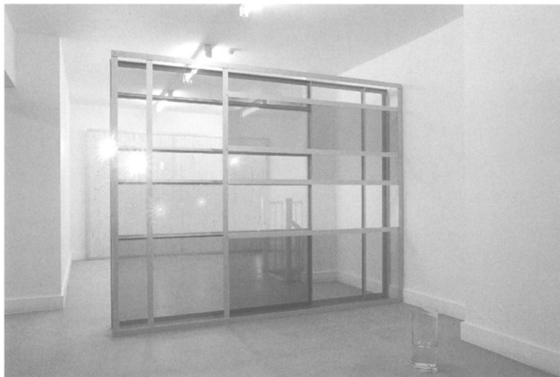
Gillick. Revision/22nd Floor Wall Design. 1998.