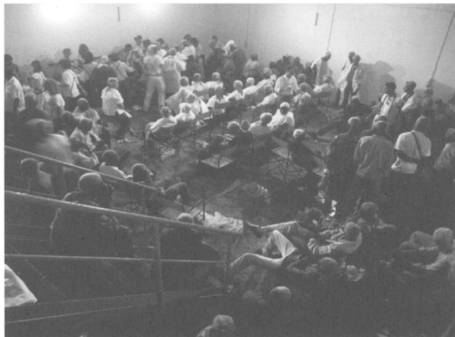
Sierra. Persons Paid to Have Their Hair Dyed Blond. Arsenale, Venice Biennale, 2001.