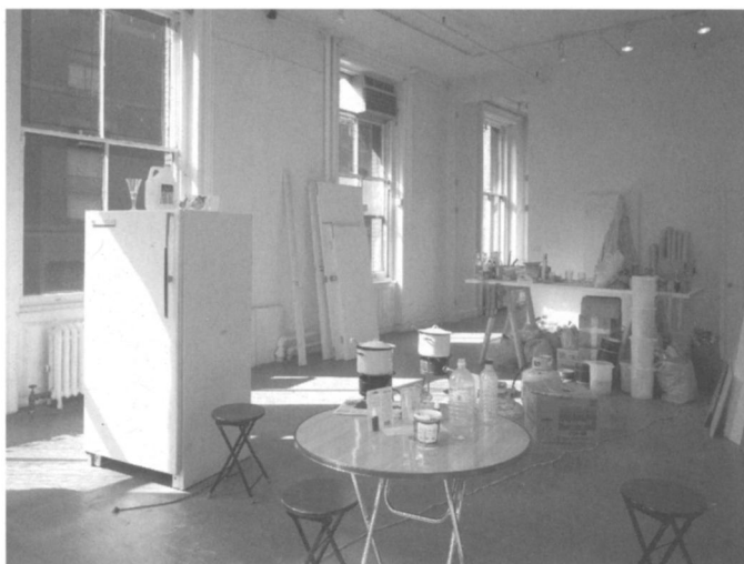
Rirkrit Tiravanija. Untitled (Free). 303 Gallery, New York, 1992.

hybrid installation performances, in which he cooks vegetable curry or pad thai for people attending the museum or gallery where he has been invited to work. In Untitled (Still) (1992) at 303 Gallery, New York, Tiravanija moved everything he found in the gallery office and storeroom into the main exhibition space, including the director, who was obliged to work in public, among cooking smells and diners. In the storeroom he set up what was described by one critic as a “makeshift refugee kitchen,” with paper plates, plastic knives and forks, gas burners, kitchen utensils, two folding tables, and some folding stools. 14 In the gallery he cooked curries for visitors, and the detritus, utensils, and food packets became the art